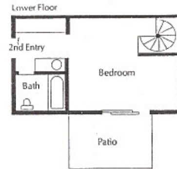
Units 7 and 8 (Split level) Full bedroom—2 baths Sleeps 4 Freestanding fireplace Patio and deck Approx. 730 sq. ft.