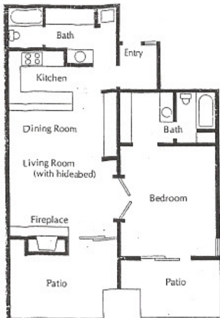
Units 1 and 2 (Lower level) Full bedroom—2 baths Sleeps 6 Fireplace, 2 patios Approx. 960 sq. ft.