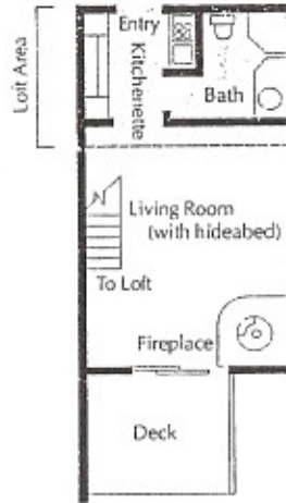
Units 5 and 6 (Upper level) Loft bedroom—1 bath Sleeps 5 Freestanding fireplace Deck Approx. 448 sq. ft. total (124 sq. ft. in loft)